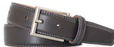
Grey Italian Matte Calf