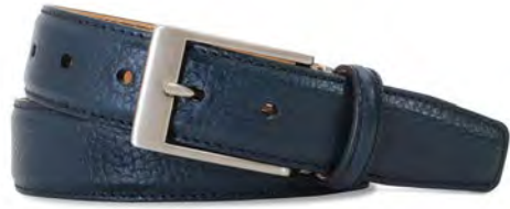
Blue Italian Scotch Grain