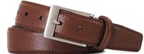
Chocolate Italian Scotch Grain