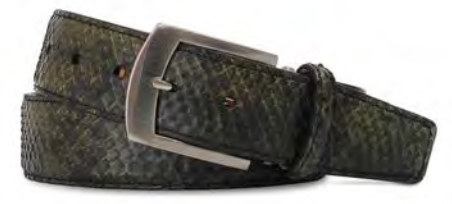
Vintage Green Python Belly Cut