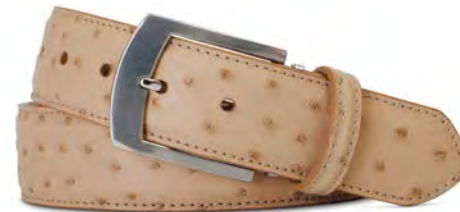
Wheat Quilled Ostrich