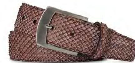
Suede Brown Python Belly Cut