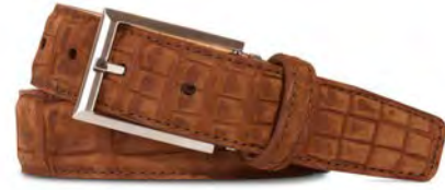
Cigar Buffed American Alligator