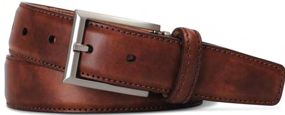
Brown Italian Marble Calf