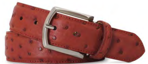
Cognac Quilled Ostrich