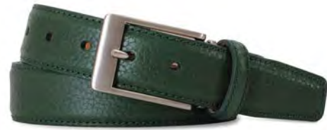
Green Italian Scotch Grain