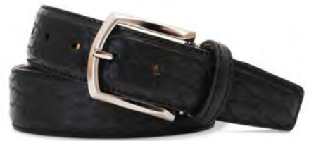
Black American Bison