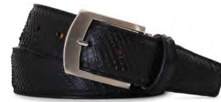
Matte Black Python Belly Cut