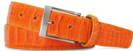
Orange Caiman Belly Crocodile