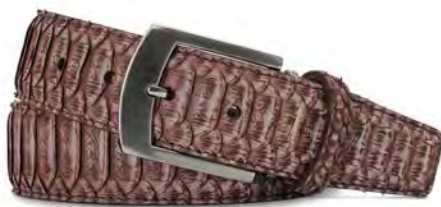
Suede Brown Python Back Cut