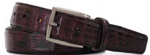
Burgundy Nile Crocodile