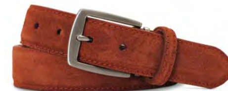
Rust Italian Suede