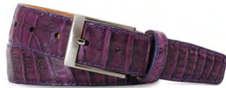
Purple Caiman Belly Crocodile