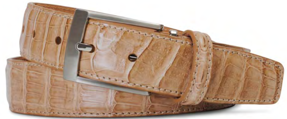
Sand Caiman Belly Crocodile