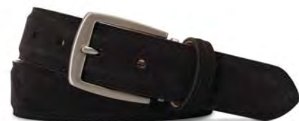
Deep Brown Italian Suede