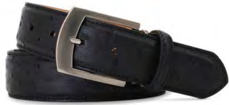
Black Quilled Ostrich