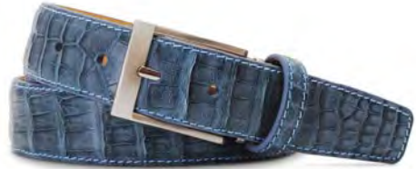
Denim Caiman Belly Crocodile