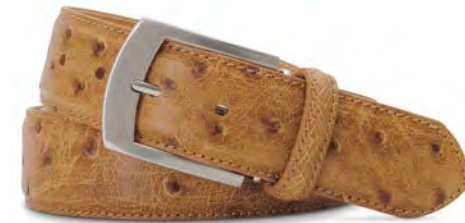
Tan Quilled Ostrich