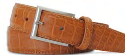
Cognac American Alligator