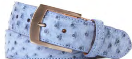
Denim Quilled Ostrich