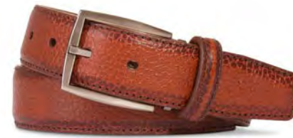
Cognac Scotch Grain Burnished