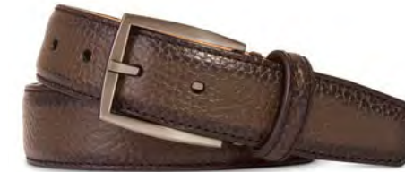
Grey Scotch Grain Burnished