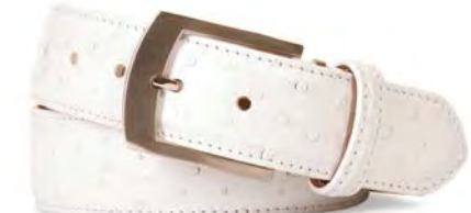
White Quilled Ostrich