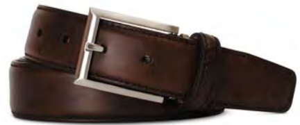
Chocolate Italian Marble Calf