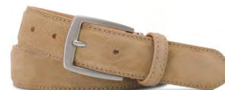
Light Tan Italian Suede