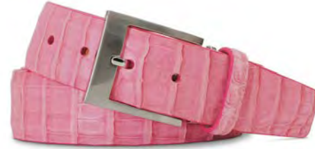
Pink Caiman Belly Crocodile