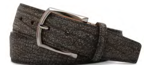
Grey African Water Buffalo