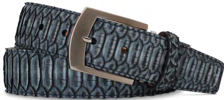
Suede Black Python Belly Cut