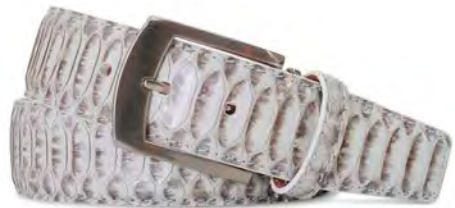
Natural Python Back Cut