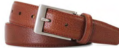
Cognac Italian Scotch Grain