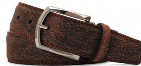
Cognac African Water Buffalo