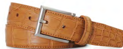
Tan American Alligator