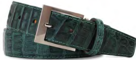
Green Caiman Belly Crocodile