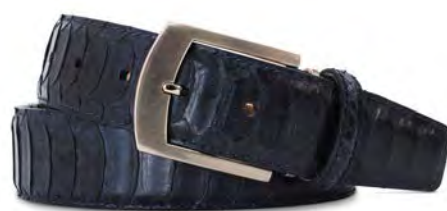
Vintage Navy Python Back Cut