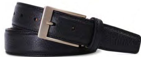
Black Italian Scotch Grain