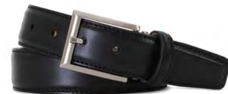
Black Italian Matte Calf