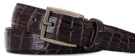
Nicotine Nile Crocodile