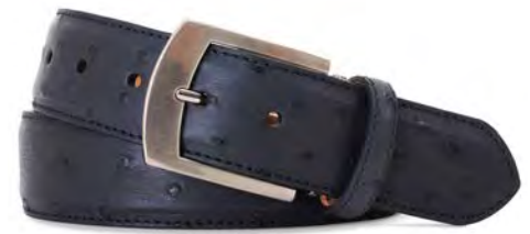
Navy Quilled Ostrich