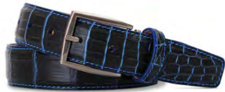
Royal Blue on Navy Nile Crocodile