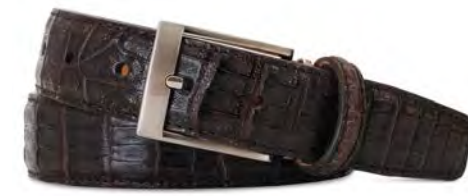
Chocolate Caiman Belly Crocodile