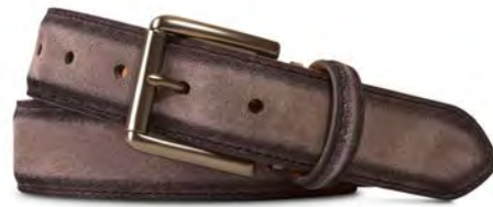
Grey Italian Suede Burnished