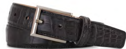
Chocolate American Alligator