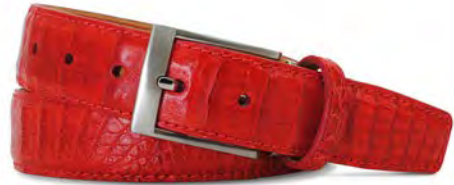
Red Caiman Belly Crocodile