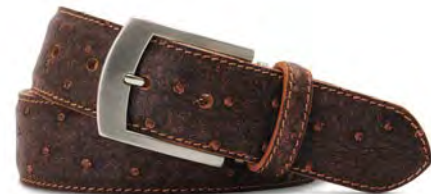
Dark Cognac Quilled Ostrich