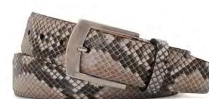
Natural Python Belly Cut