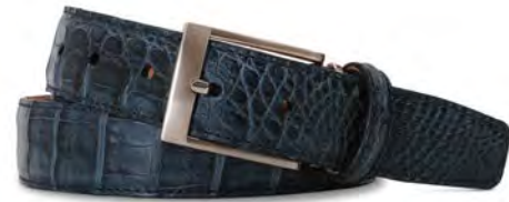
Navy Caiman Belly Crocodile