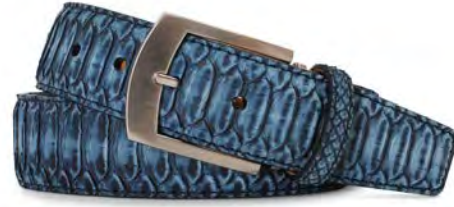
Suede Navy Python Back Cut