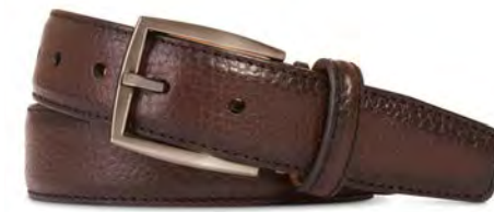
Deep Brown Scotch Grain Burnished