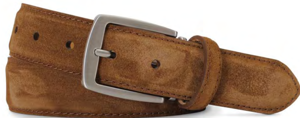
Brown Italian Suede