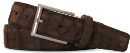
Chocolate Buffed American Alligator