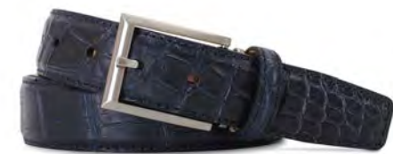
Navy American Alligator