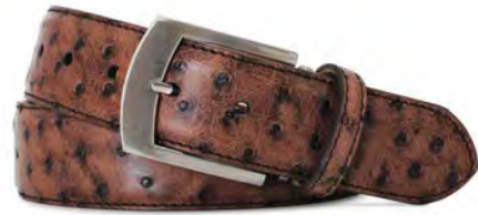
Bruciatto Quilled Ostrich