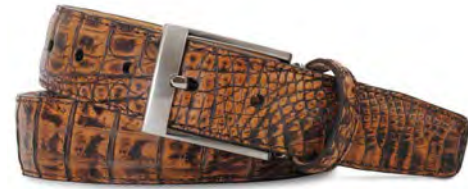
Antique Pecan Caiman Belly Crocodile