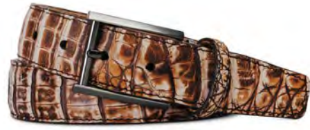
Desert Caiman Belly Crocodile