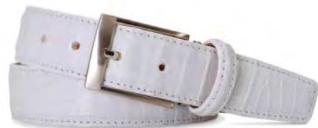
White Caiman Belly Crocodile