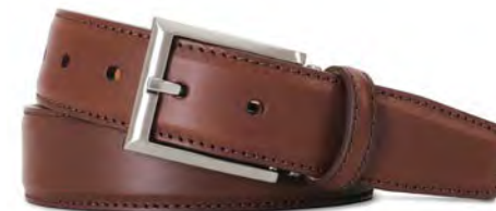
Chocolate Italian Matte Calf