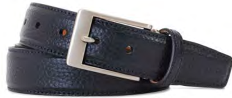
Navy Italian Scotch Grain