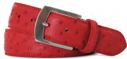
Red Quilled Ostrich