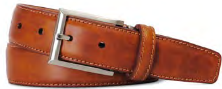
Tan Italian Marble Calf