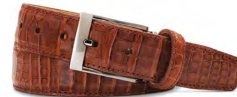
Cognac Caiman Belly Crocodile