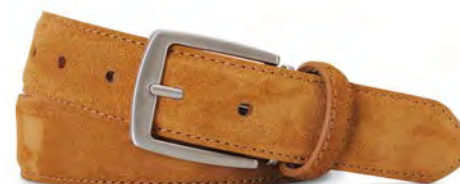
Toast Italian Suede