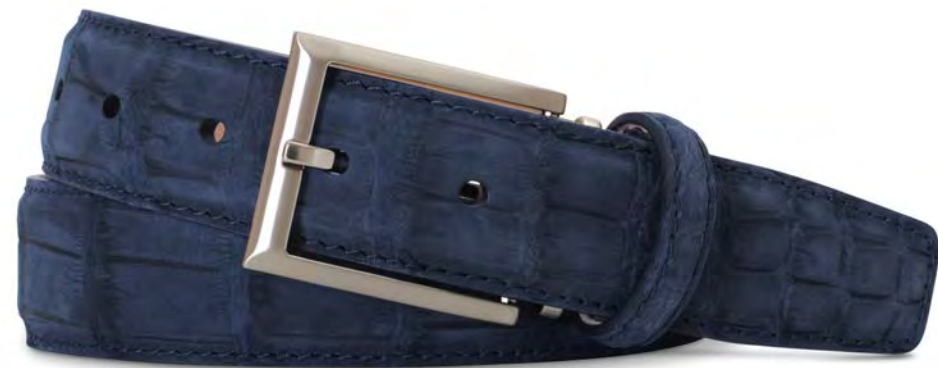
Navy Buffed American Alligator