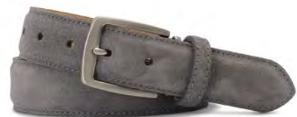
Grey Italian Suede