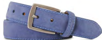
Denim Italian Suede