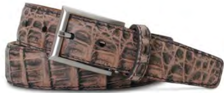
Cigar Black Caiman Belly Crocodile