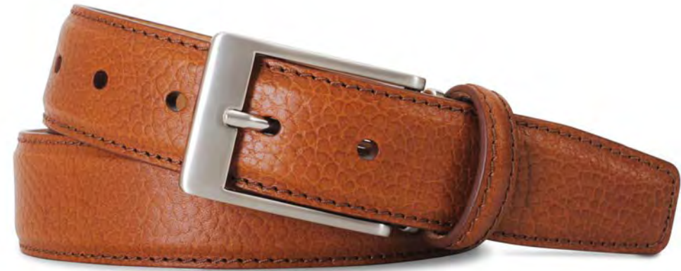
Tan Italian Scotch Grain