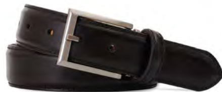
Chocolate Italian Glazed Calf