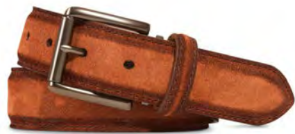
Rust Italian Suede Burnished