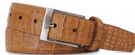
Tan Caiman Belly Crocodile