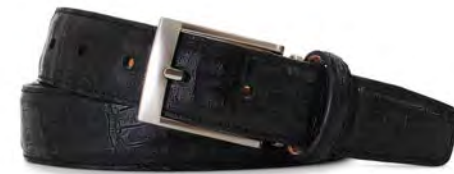
Black Caiman Belly Crocodile