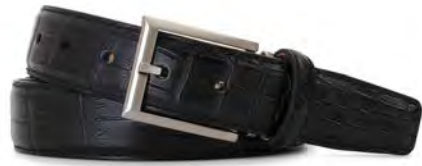
Black American Alligator