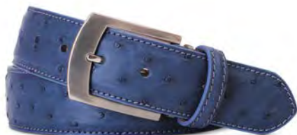
Steel Quilled Ostrich