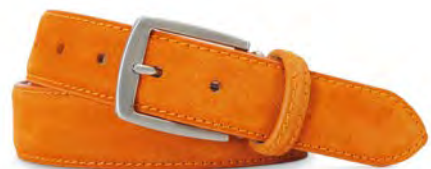
Orange Italian Suede