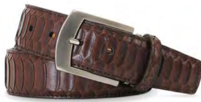
Matte Brown Python Back Cut