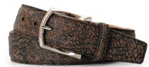
Chocolate African Water Buffalo