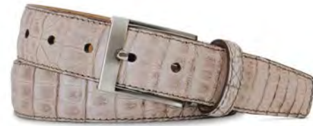
White Ash Caiman Belly Crocodile