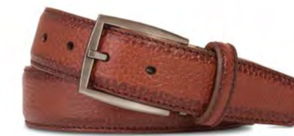
Chocolate Scotch Grain Burnished