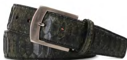
Vintage Green Python Back Cut