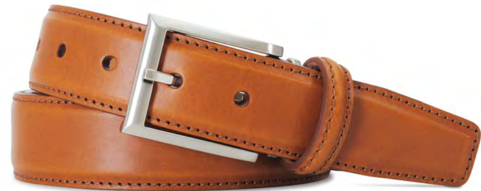
Tan Italian Matte Calf