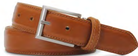
Tan Italian Glazed Calf