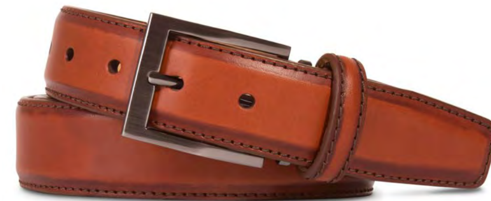
Cognac Matte Calf Burnished