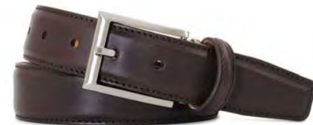
Deep Brown Italian Matte Calf