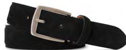
Black Italian Suede