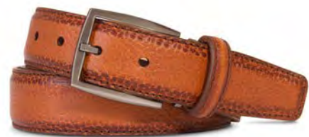
Tan Scotch Grain Burnished