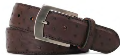
Nicotine Quilled Ostrich