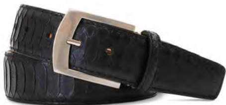
Matte Black Python Back Cut