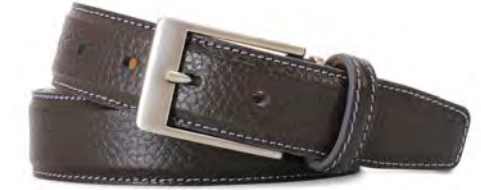
Grey Italian Scotch Grain