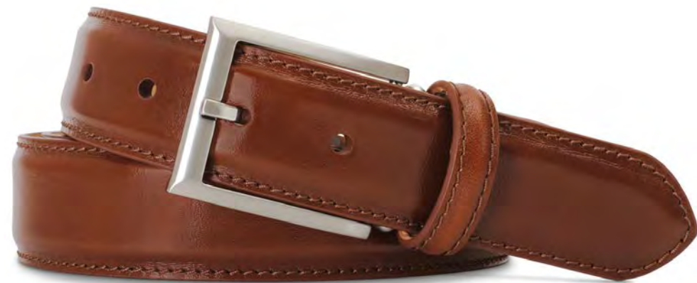
Brown Italian Glazed Calf