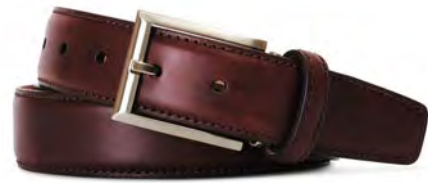
Cigar Italian Marble Calf