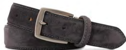
Charcoal Italian Suede