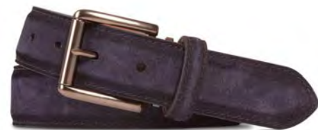
Navy Italian Suede Burnished