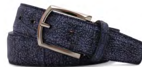
Navy African Water Buffalo