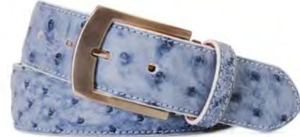
Blue Jean Quilled Ostrich