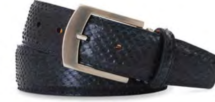
Vintage Navy Python Belly Cut