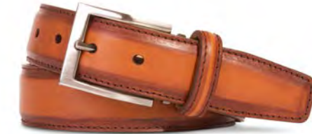
Tan Matte Calf Burnished