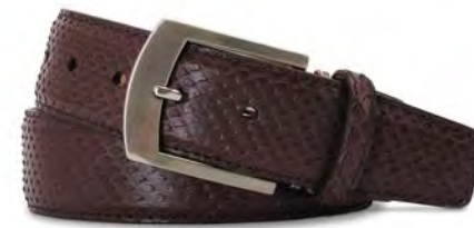
Matte Brown Python Belly Cut