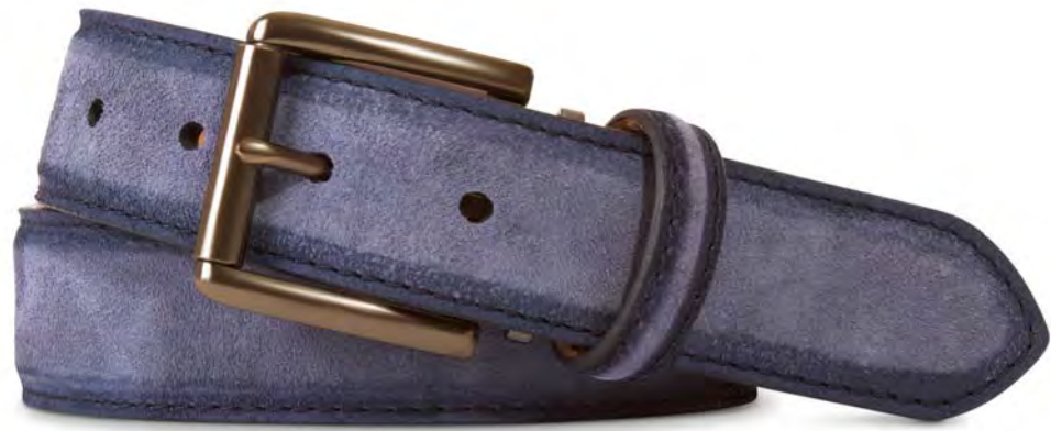
Denim Italian Suede Burnished