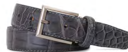
Charcoal American Alligator