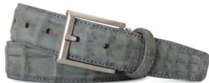
Grey Buffed American Alligator