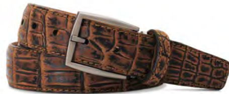
Suede Saddle Tan Nile Crocodile