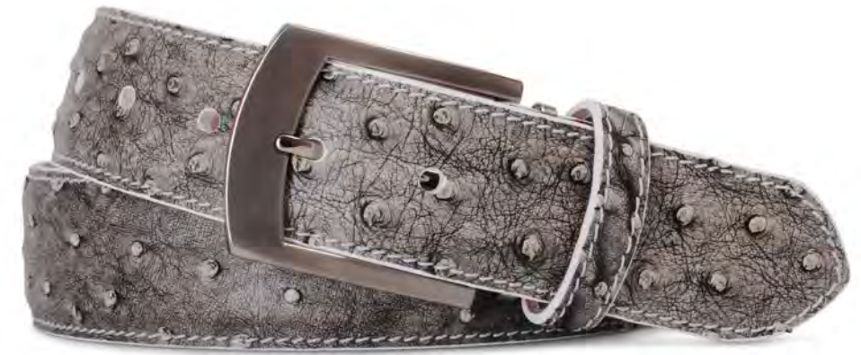
Bone Quilled Ostrich