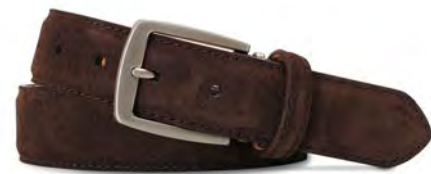
Chocolate Italian Suede