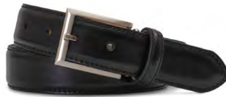
Black Italian Glazed Calf