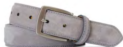
Light Grey Italian Suede