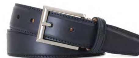
Navy Italian Matte Calf