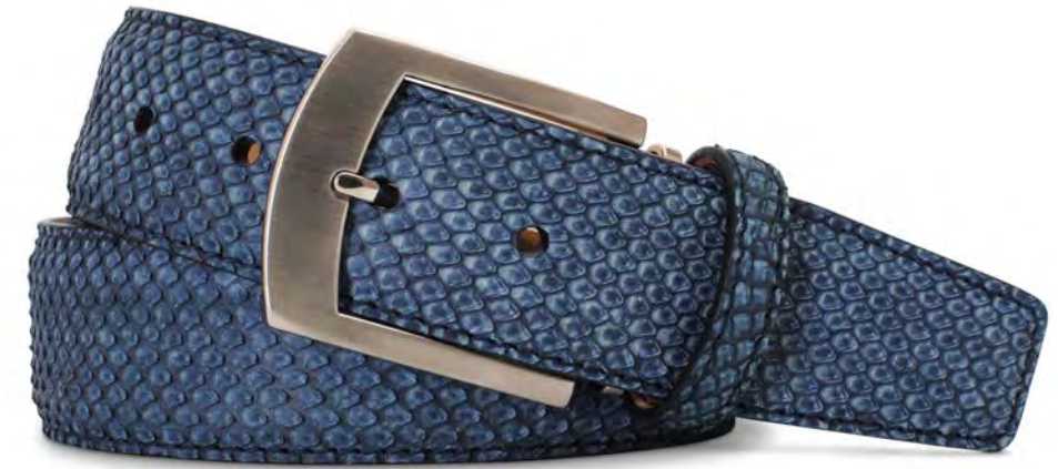
Suede Navy Python Belly Cut