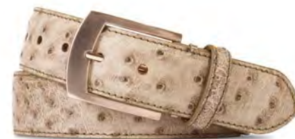
Moss Quilled Ostrich