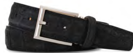
Black Buffed American Alligator