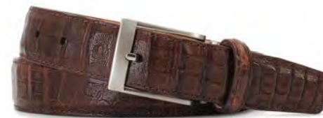
Cigar Caiman Belly Crocodile