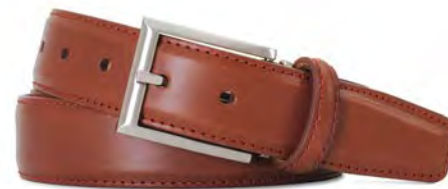
Cognac Italian Matte Calf