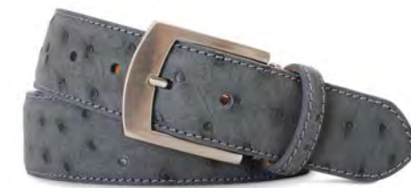
Grey Quilled Ostrich