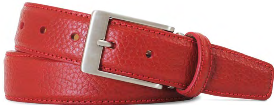
Red Italian Scotch Grain