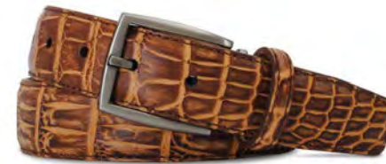
Saddle Tan Nile Crocodile