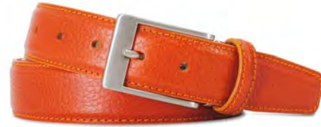
Orange Italian Scotch Grain