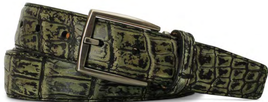
Suede Green Nile Crocodile