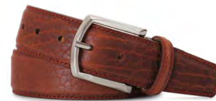
Peanut American Bison