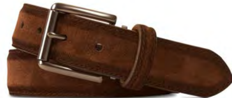
Chocolate Italian Suede Burnished