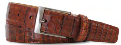
Antique Honey Caiman Belly Crocodile