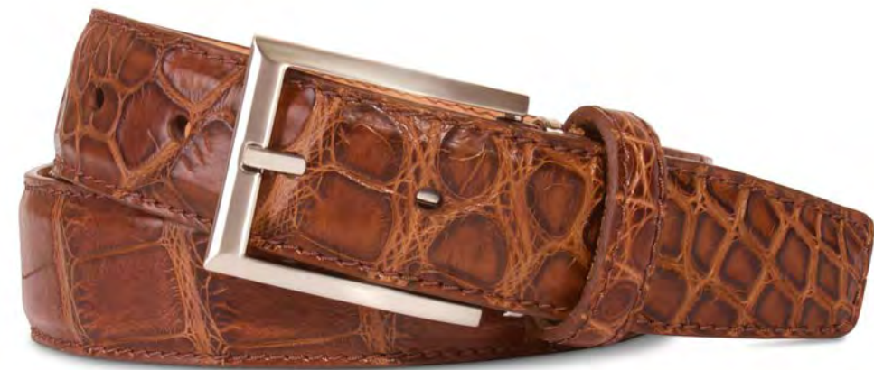
Cigar American Alligator