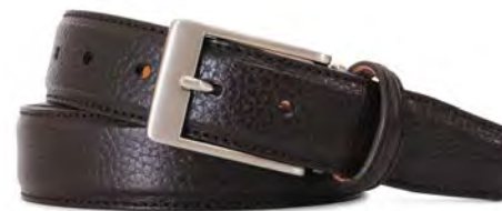
Deep Brown Italian Scotch Grain