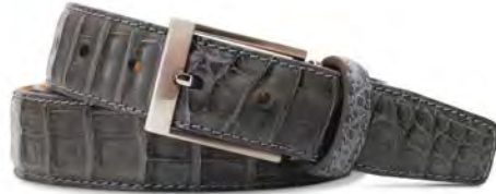
Grey Caiman Belly Crocodile