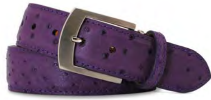
Purple Quilled Ostrich