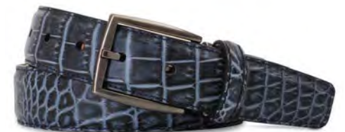
Blue Grey Nile Crocodile