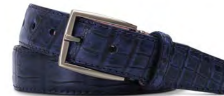
Vintage Blue Nile Crocodile