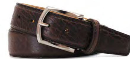
Chocolate American Bison