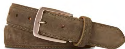
Olive Italian Suede