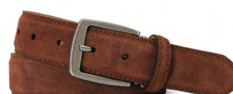
Polo Brown Italian Suede