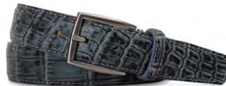
Suede Blue Grey Nile Crocodile