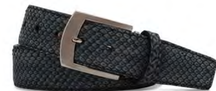
Suede Black Python Belly Cut