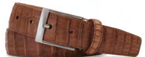
Pecan Caiman Belly Crocodile