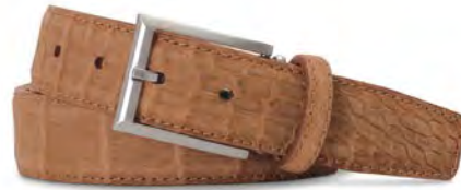
Brown Buffed American Alligator