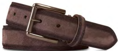
Charcoal Italian Suede Burnished