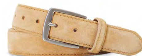
Beige Italian Suede