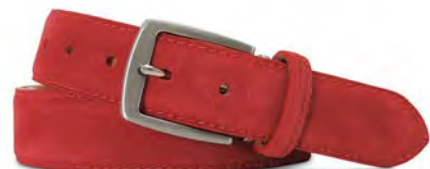
Red Italian Suede