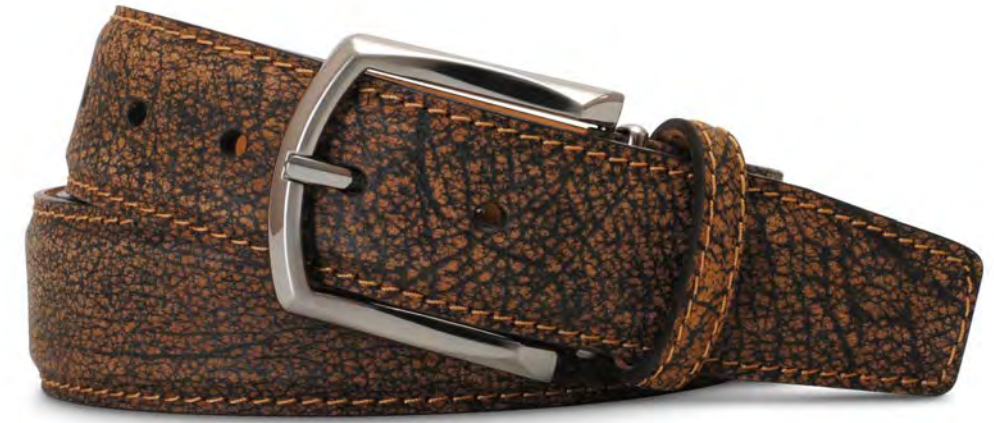
Tan African Water Buffalo