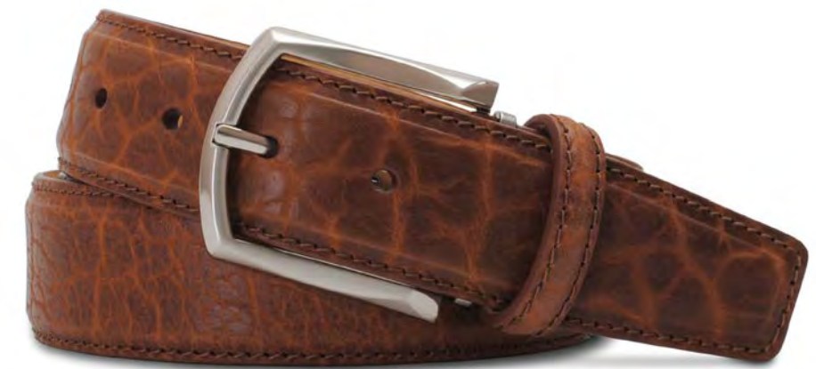
Cognac American Bison