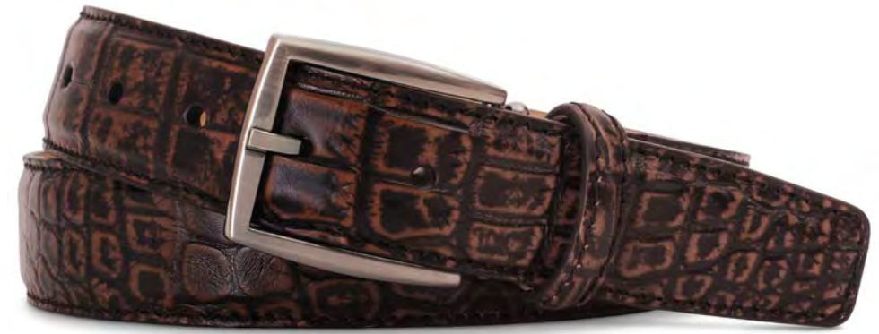
Vintage Saddle Tan Nile Crocodile