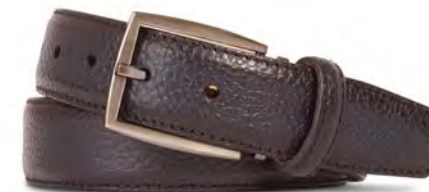
Navy Scotch Grain Burnished