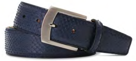
Matte Navy Python Belly Cut