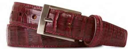
Burgundy Caiman Belly Crocodile