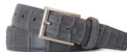
Grey American Alligator