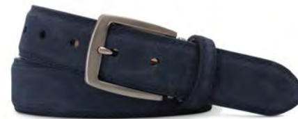
Navy Italian Suede