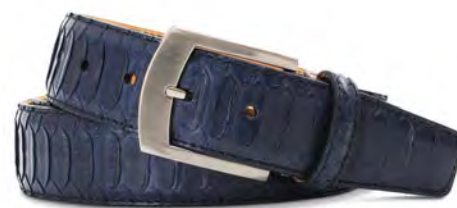
Matte Navy Python Back Cut