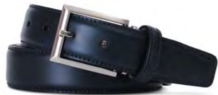
Navy Italian Marble Calf