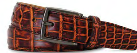
Rum Brown Nile Crocodile