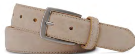
Sand Italian Suede